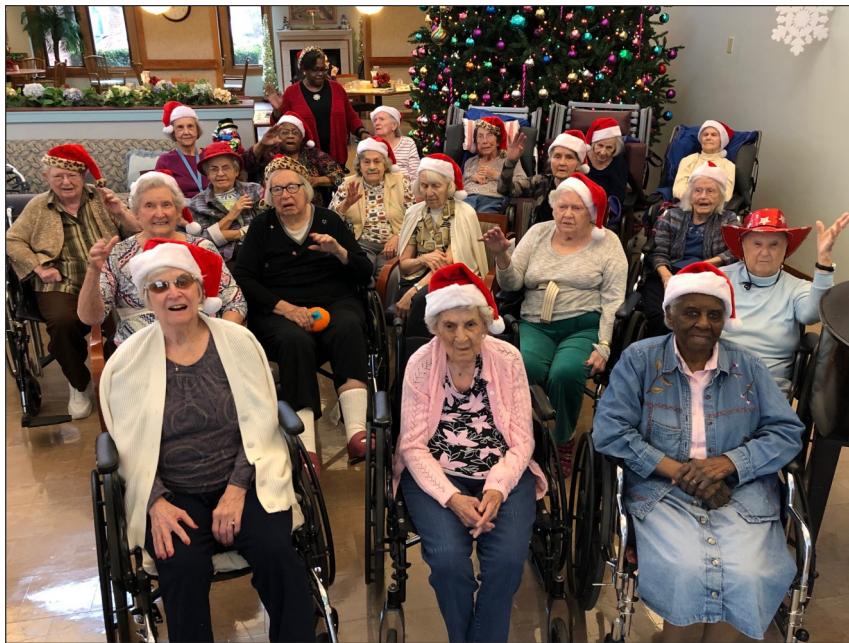
Everyone really got into the spirit of the holidays!

We are extremely proud of everyone who put the ladies' care ahead of their own comfort and safety in such extreme conditions. That's what makes the Mary Culver Home very special!