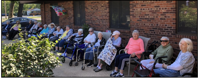
The shaded area along the sidewalk has become a favorite spot for residents in the summer.