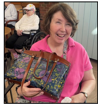
Raffle winners took home a purse, above, and a basket of tea-themed items, below.