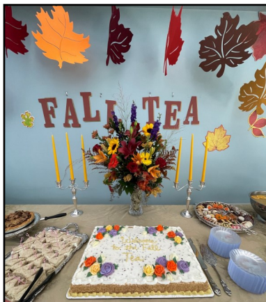
Another Fall Tea tradition is to serve carrot cake.