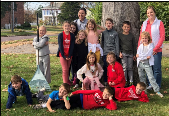
... the second-grade class at St. Peter Catholic School in Kirkwood for cleaning up our leaves! We really appreciate all the hard work to make our home look beautiful.